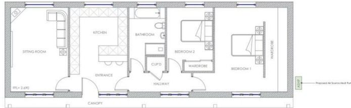
PROPOSED FLOOR PLAN