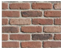
2. OLD CASTLE BLEND BRICK