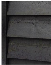
3. BLACK FEATHER EDGE CLADDING